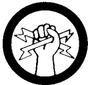
Electricity PM Session Only Limit 12