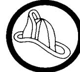
Fire Safety AM Session Only Limit 12