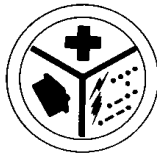
Emergency Prep All Day Session Limit 12