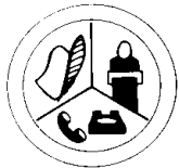
Communications All Day Session Limit 12