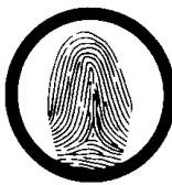
Fingerprinting AM Session Only Limit 12