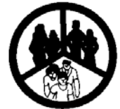
Family Life AM & PM Sessions Limit 12 Each