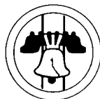
Citizenship in the Nation AM session only Limit 10