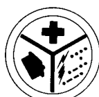
Emergency Prep Day Long session Limit 10