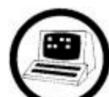
Computers PM session only Limit 10