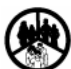
Family Life AM session only Limit 12