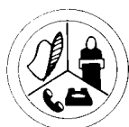
Communications Day Long Session Limit 12