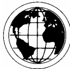
Citizenship in the World Day long session Limit 10