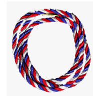
Den Chief Training Day Long Session Limit 10 Scouts