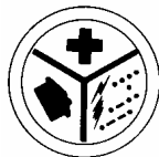
Emergency Prep Day Long session Limit 10