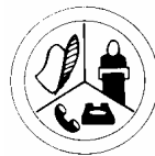
Communications Day Long Session Limit 16