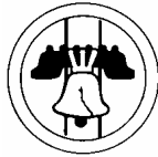
Citizenship in the Nation PM session only Limit 10