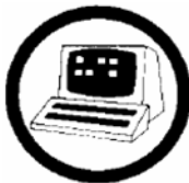
Computers AM & PM Sessions Limit 12