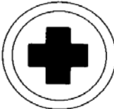
First Aid All Day Session Limit 12