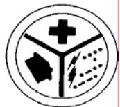
Emergency Prep All Day Session Limit 12