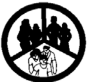
Family Life AM & PM Sessions Limit 12