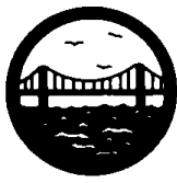
Engineering AM & PM Sessions Limit 12