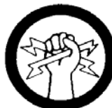
Electricity All Day Session Limit 12