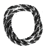
Den Chief Training All Day Session Limit 12 ($5.00 for Den Chief Handbook)