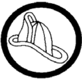
Fire Safety All Day Session Limit 12