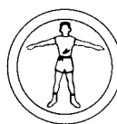
Personal Fitness All Day Limit 12