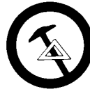
Drafting PM Limit 8