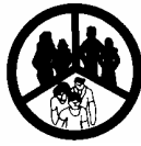
Family Life AM Limit 12