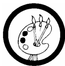
Art PM Limit 8