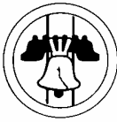
Citizenship Nation PM Limit 12