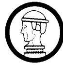
Sculpture AM Limit 8