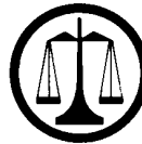
Law AM Limit 8