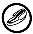
Leatherwork AM Limit 8