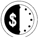
Personal Management PM Limit 12