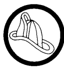
Fire Safety All Day Limit 10