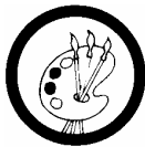
Art AM Limit 8