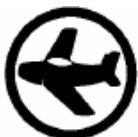
Aviation All Day Limit 10