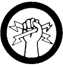
Electricity PM Limit 8