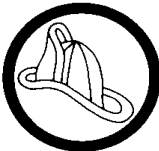
Fire Safety All Day Session Limit 12