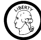
Coin Collecting AM Session Limit 12