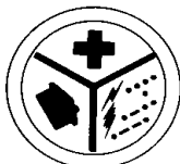
Emergency Prep All Day Session Limit 12