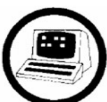
Computers AM & PM Sessions Limit 12