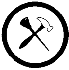
Home Repairs All Day Limit 12