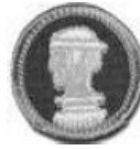
Sculpture PM Limit 8