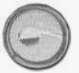
Chemistry AM Limit 12