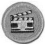
Cinematography PM Limit 8