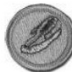
Leatherwork AM Limit 8