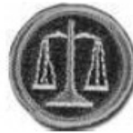
Law AM Limit 12