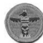
Weather AM Limit 10