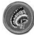
Indian Lore All Day Limit 15