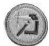
Woodworking AM Limit 8