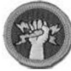
Electricity AM Limit 8