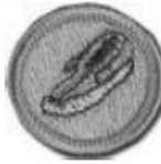
Leatherwork PM Limit 8