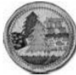
Landscape Architecture AM Limit 8