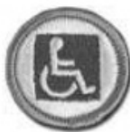
Disabilities Awareness All Day Limit 10