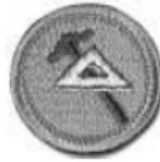
Drafting All Day Limit 8