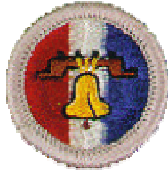
Citizenship Nation PM session Limit 12