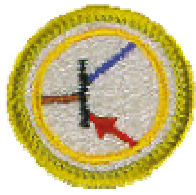
Electronics PM Session Limit 12