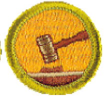
Public Speaking Day Long Session

Boy Scout Leader Training 1 & 2 Registration: 8:00 AM New Leader Essentials AM Session Starts: 8:30 AM Leader Specific (CS & BS) PM Session Starts: 12:30 PM Cost: $7 for New Leader Essentials or $10.00 for Leader Specific $17.00 for both Sessions (Leader Specific includes cost of book)