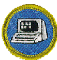
Computers Day Long Session Limit 10 Off-site Permission slip required