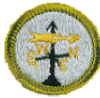
Weather PM session Limit 12