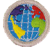
Citizenship in the World AM Session Limit 12