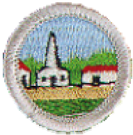
Citizenship Community AM session Limit 12