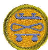
Ice Skating AM Session Limit 10 Weather permitting Off-site Permission slip req. must bring ice skates