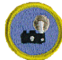
Photography AM Session Limit 10 $1 materials fee to counselor Must bring 35mm camera w/ film or digital camera w/ blank memory card