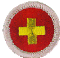
First Aid Day Long session Limit 12