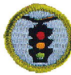
Traffic Safety AM Limit 10