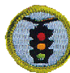
Traffic Safety PM Limit 10