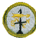
Weather AM Limit 12