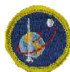
Space Exploration PM Limit 10