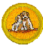
Dog Care AM Limit 10