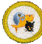
Pets AM Limit 10