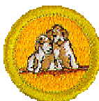
Dog Care PM Limit 10