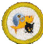
Pets PM Limit 10