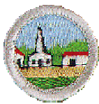
Citizenship in the Community AM Limit 10