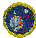
Space Exploration AM Limit 12