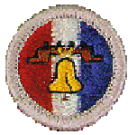
Citizenship in the Nation AM Limit 10