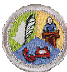
Communication AM Limit 8