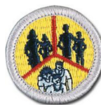
Family Life PM Limit 12