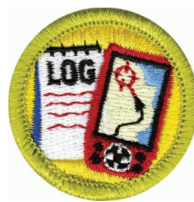
Geocaching All Day Limit 10 See pre-requisites