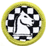
Chess AM Limit 12