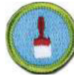
Painting AM Limit 12