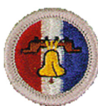
Citizenship in the Nation PM Limit 12