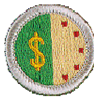
Personal Management All Day Limit 12