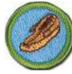
Leatherwork AM Limit 12