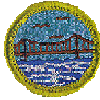
Engineering AM Limit 12