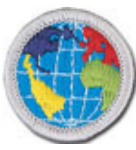
Citizenship in the World PM Limit 12