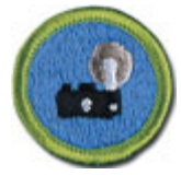
Photography AM Limit 12