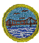
Engineering PM Limit 12