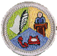
Communications All Day Limit 12