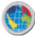
Citizenship in the World AM Limit 12