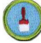
Painting PM Limit 12