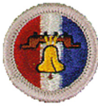
Citizenship in the Nation AM Limit 12