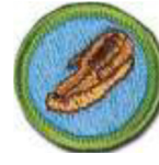
Leatherwork PM Limit 12