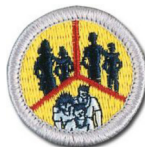
Family Life AM Limit 12